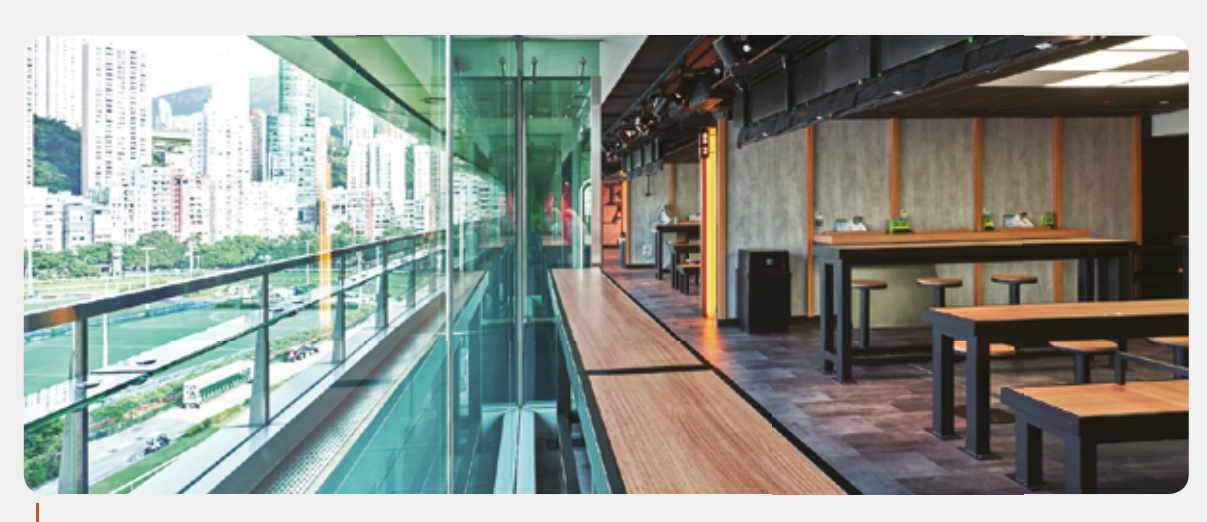
Overlooking the racecourse from a balcony