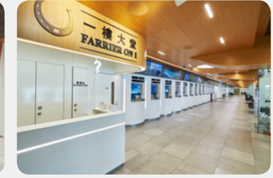
Spacious environment with free Wi-Fi